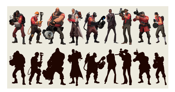
Figure 2: The nine character classes of Team Fortress 2 were designed to be visually distinct from one another. Even when viewed only in silhouette with no internal shading at all, the characters are readily identifiable to players. While characters never appear in such unflattering lighting conditions in Team Fortress 2, demonstrating the ability to visually read the characters even with no internal detail was used to validate the character design during the concept phase of the game design.

Players of multiplayer combat games such as Team Fortress 2 must be able to visually identify other players very quickly at a variety of distances and viewpoints in order to assess the possible threat. In Team Fortress 2 in particular, the player's class—Demo, Engineer, Heavy, Medic, Pyro, Spy, Sniper, Soldier or Scout—is extremely important to gameplay and hence the silhouettes of the nine classes were carefully designed to be very distinct from one another, as shown in Figure 2.